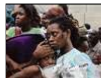
The Dallas Morning News

• Katrina then and now View photographs comparing scenes during and immediately after Hurricane Katrina with recent photographs of the same locations.